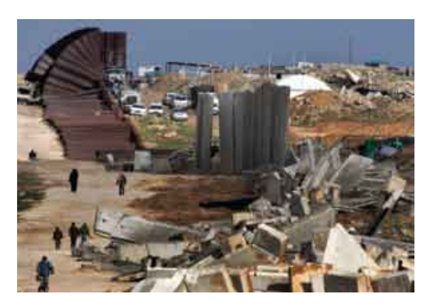
Palestinians pass by the destroyed part of the Egyptian-Gaza border in Rafah, southern Gaza Strip, Jan. 31, 2008. Hundreds of thousands poured across the breached border.

Hizbullah has placed hundreds of rocket installations south of the Litani River, under heavy civilian cover in Shiite villages and rural areas.